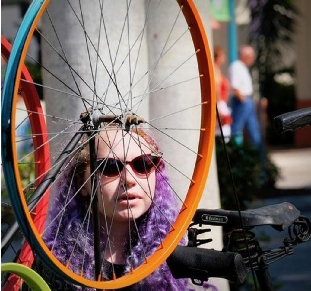
Community project with high school volunteer