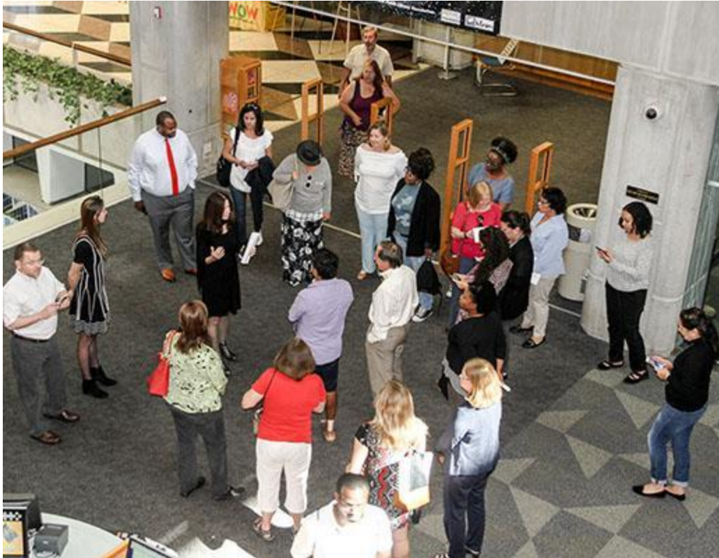
Fresh Cup of Art tour guests and Broward Cultural Division on the library's second floor patio where attendees gathered for coffee and conversation after the tour.