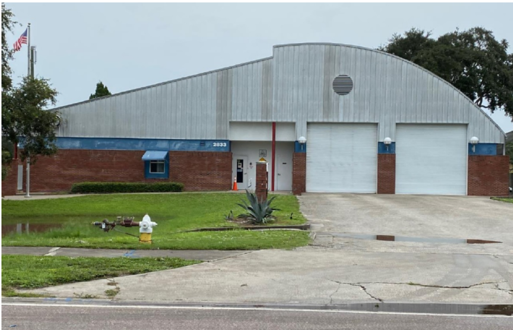
Fire Station 62

https://www.dunedingov.com/about/arts-culture/calls-to-artists