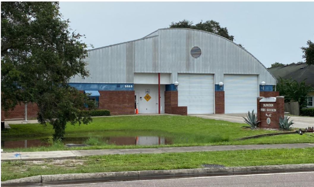
Fire Station 62 with retention pond