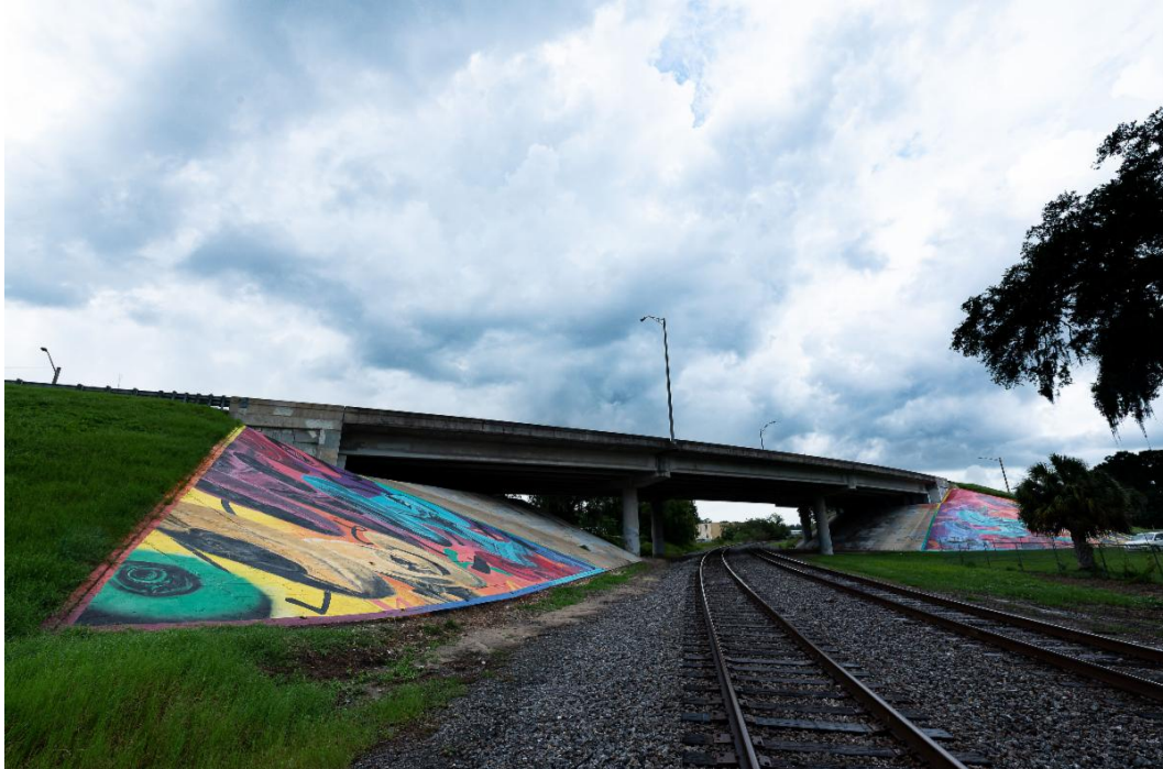
Completed Mural