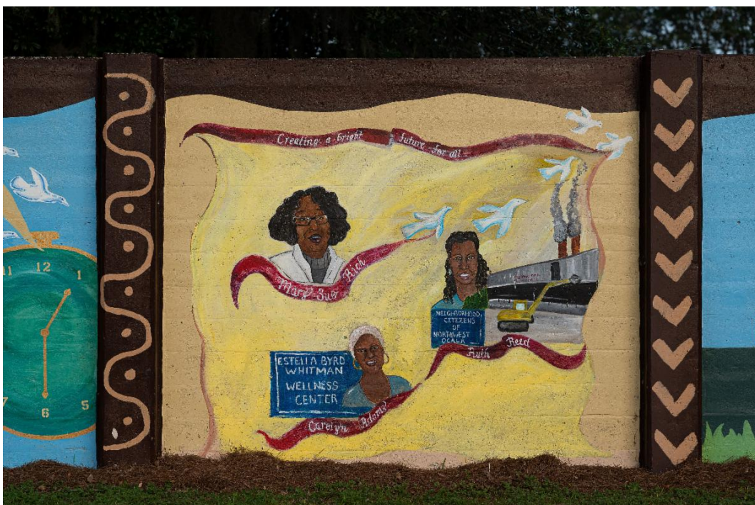
New Panel by Michele Faulconer