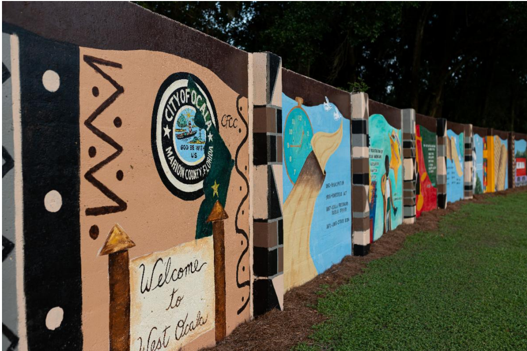
Overview Photo

In 2019, the mural restoration project brought together many of the original collaborators, as well as current community stakeholders. The goal was to clean and invigorate the existing mural and add a new panels celebrating the developments in the community since the mural's creation fourteen years ago.