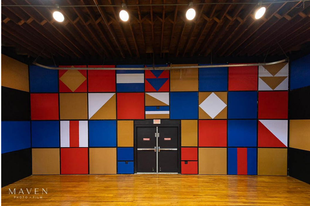
Patchwork Parable