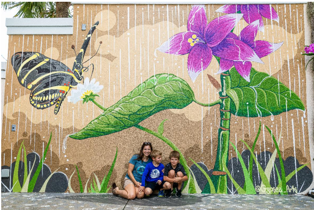
Completed Mural with family participating