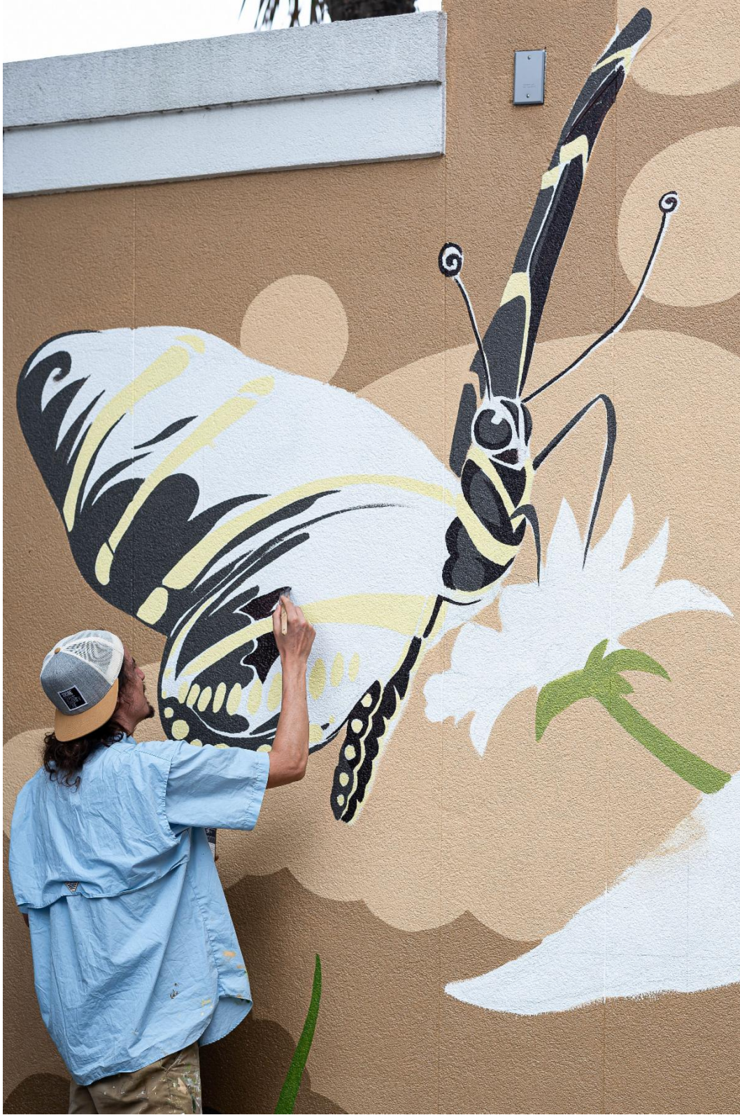
Progress Photo