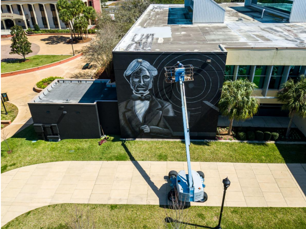
Progress Photo