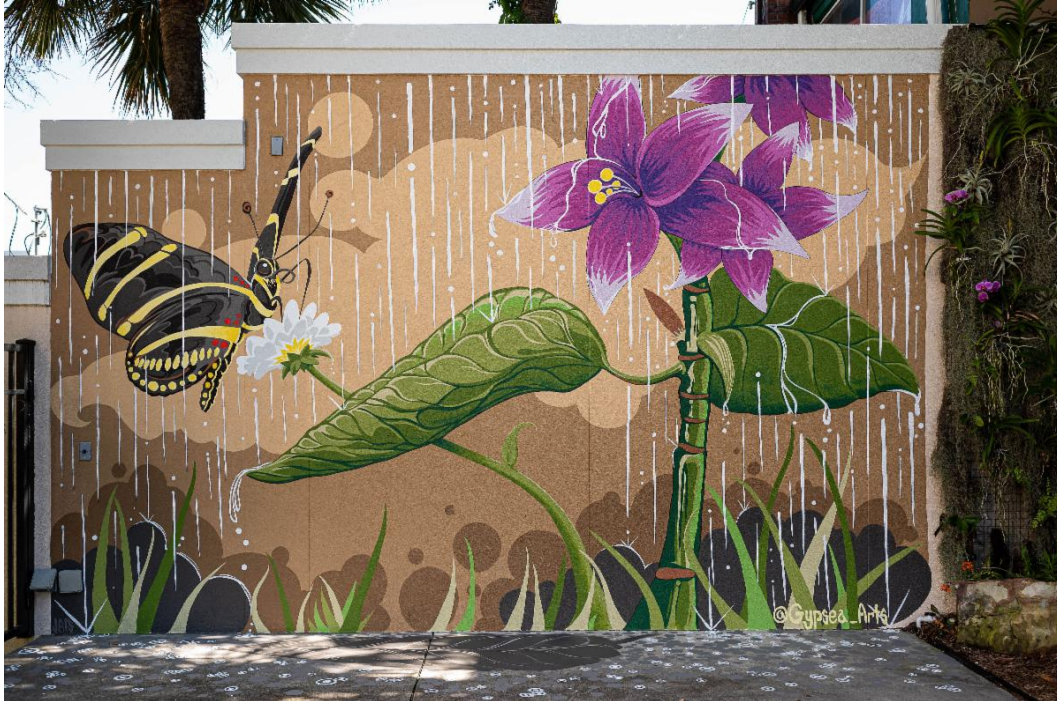
Selfie Mural Wall alone