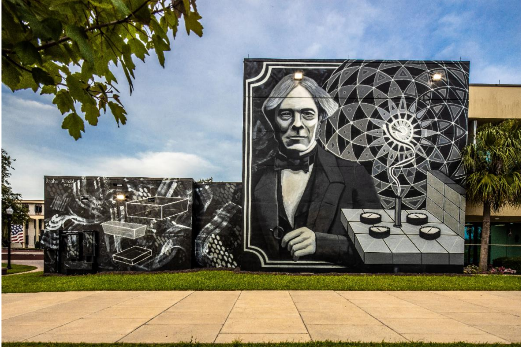
Completed Mural w/o AR shown