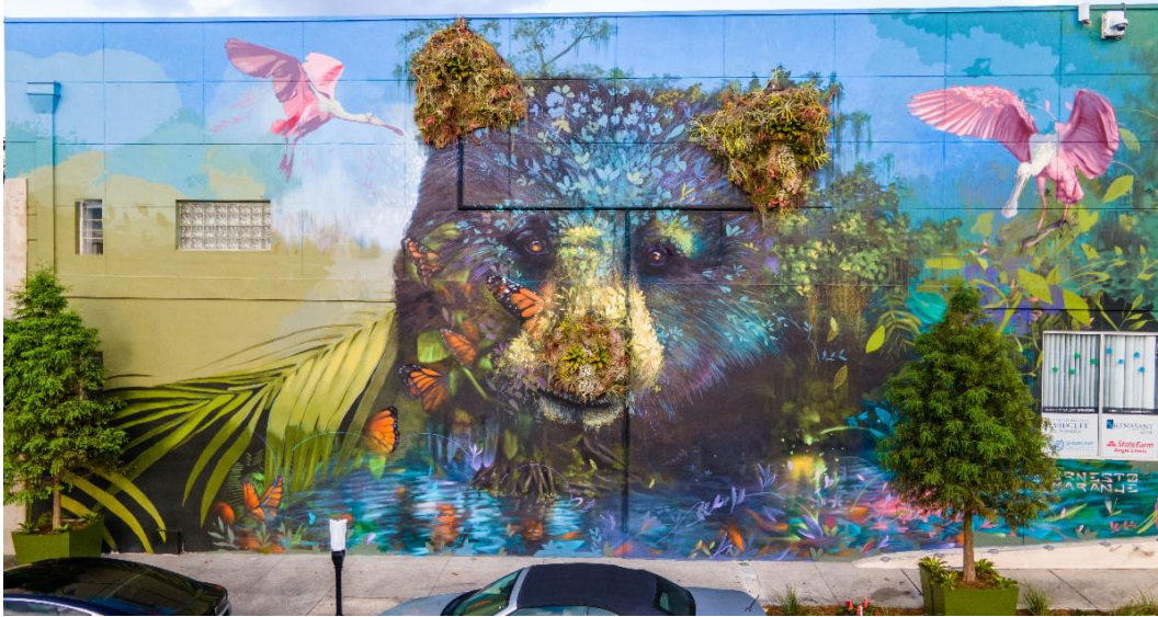
Completed Living Art Mural, Reflections through Flora