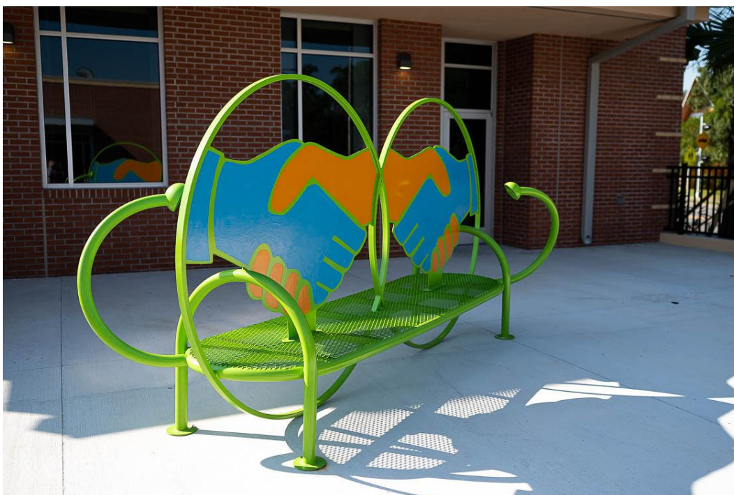
A Friendly Exchange