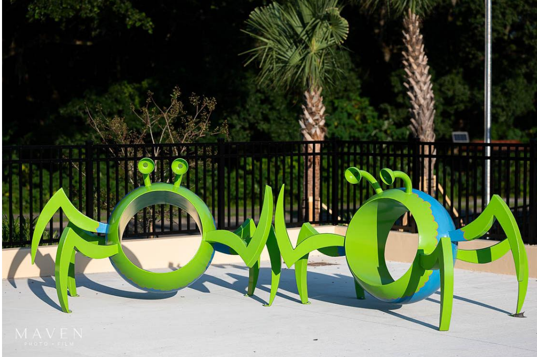
Chatter Bugs