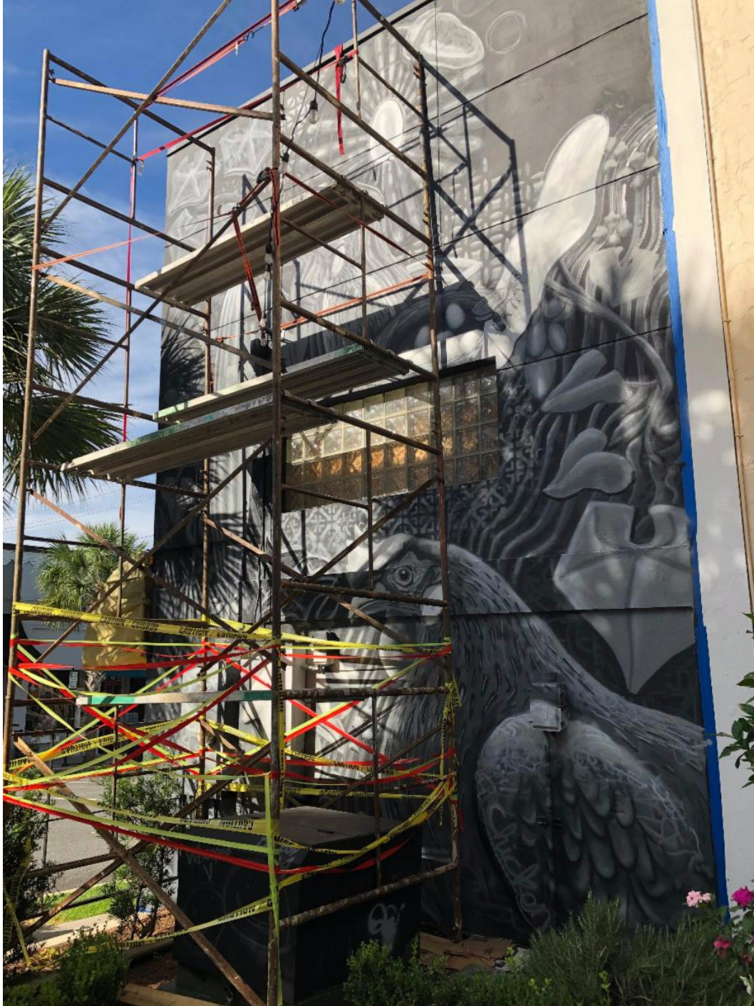
Progress Photo of Life Cycle