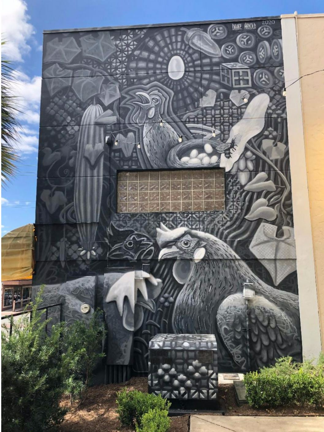
Life Cycle