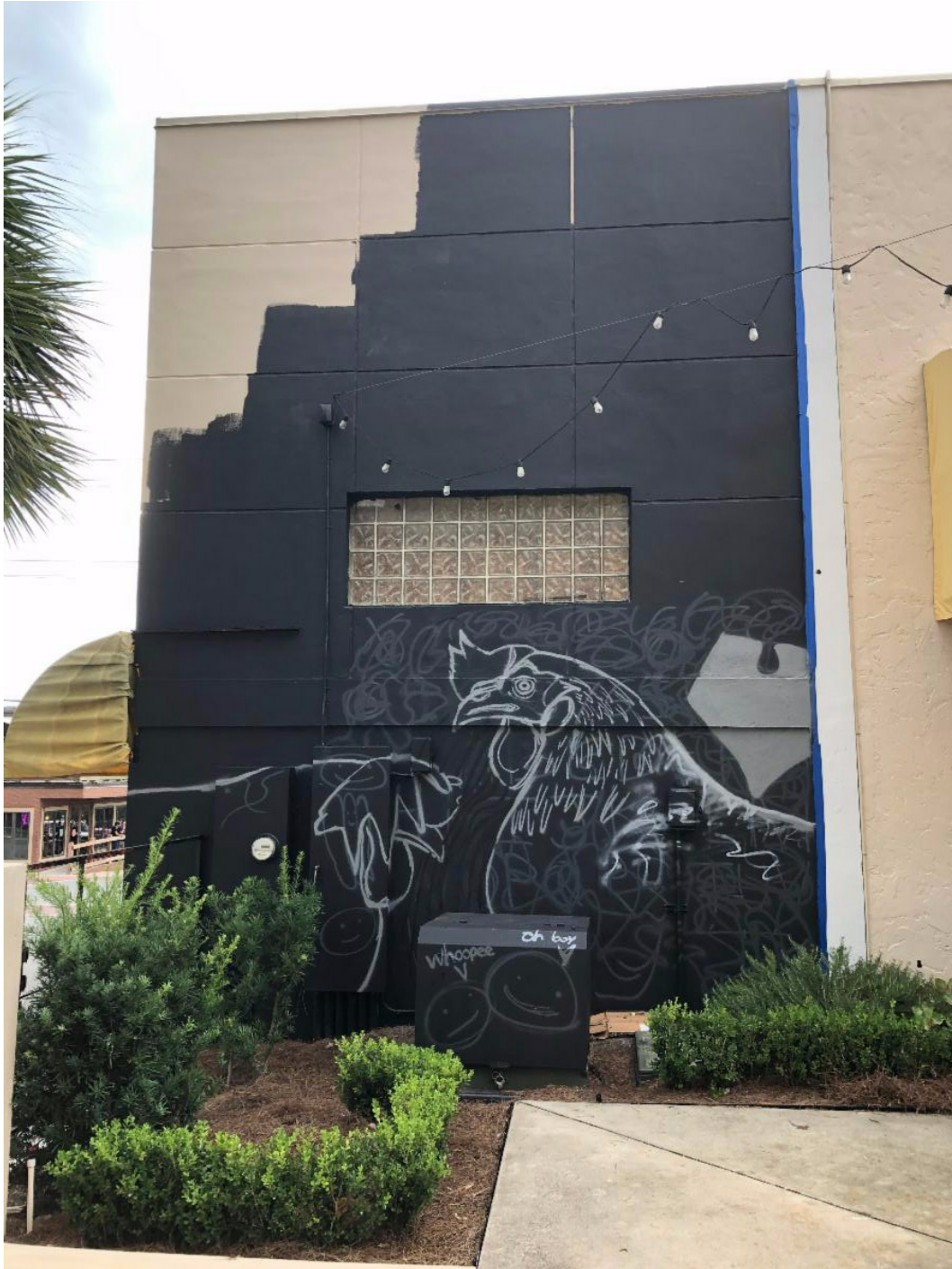
Beginnings of Life Cycle