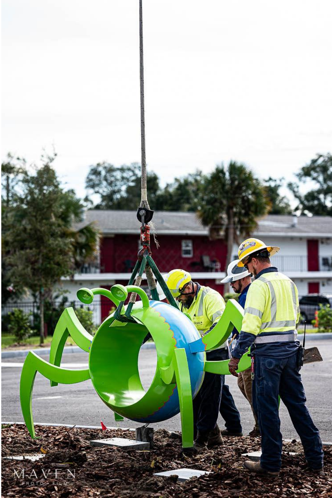
Crews installing Chatter Bug