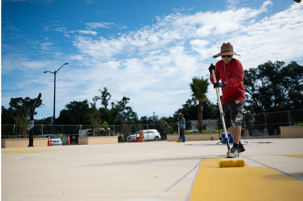
Daas Painting