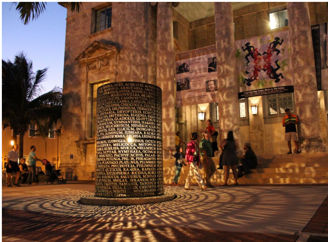
Caloosahatchee Manuscripts by Jim Sanborn

The mission of FAPAP is dedicated to the development, advocacy, promotion and education of the public art field in the State of Florida, as well as to promote national best practices in the administration of public art programs.