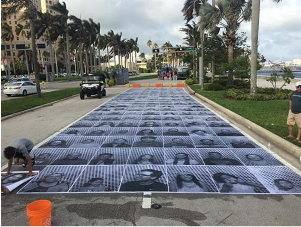
City of West Palm Beach