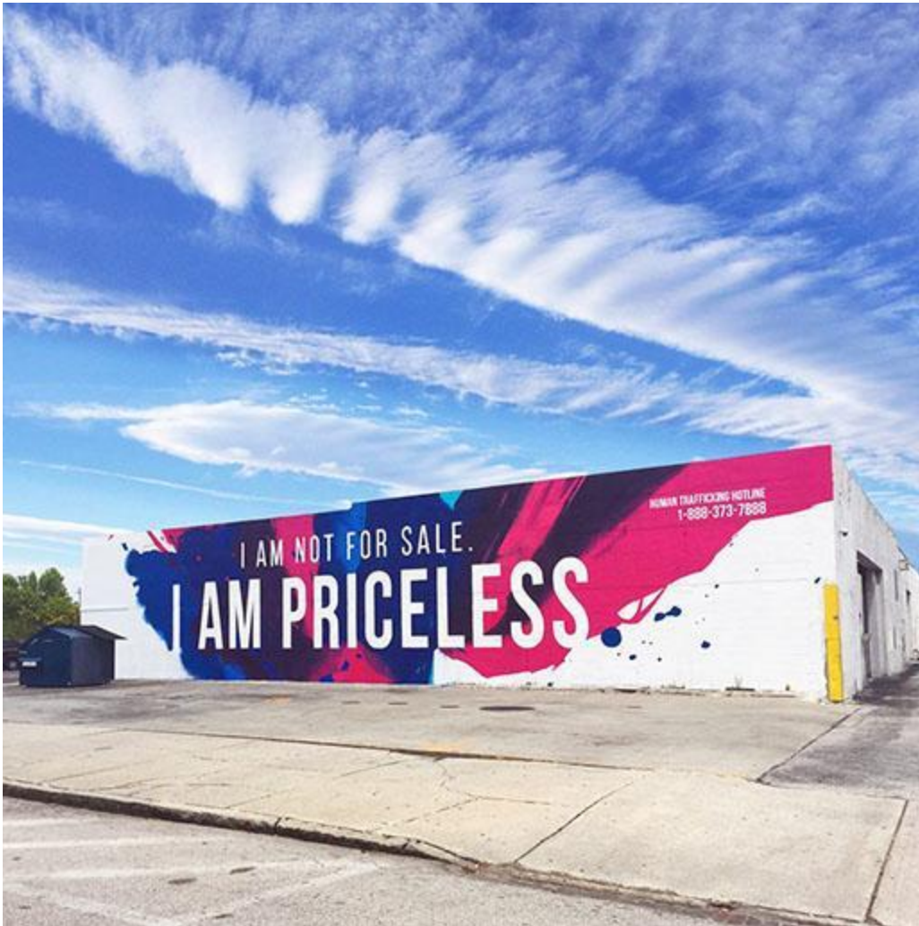
I Am Priceless by Tes One Photo: Tes One