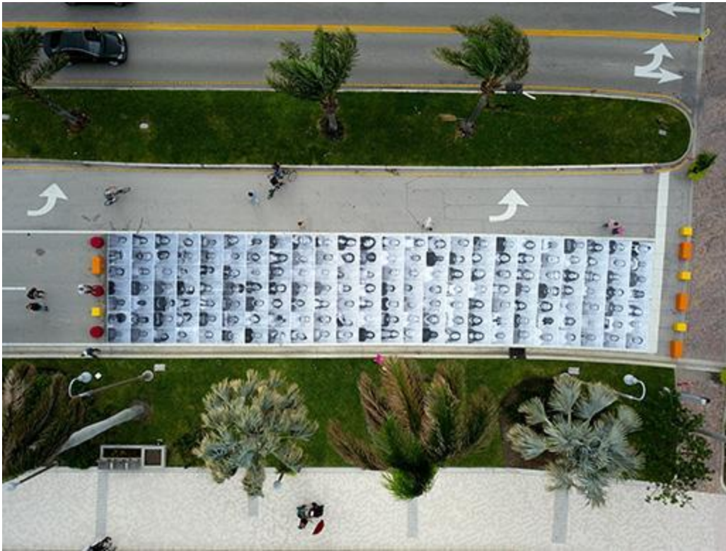
City of West Palm Beach