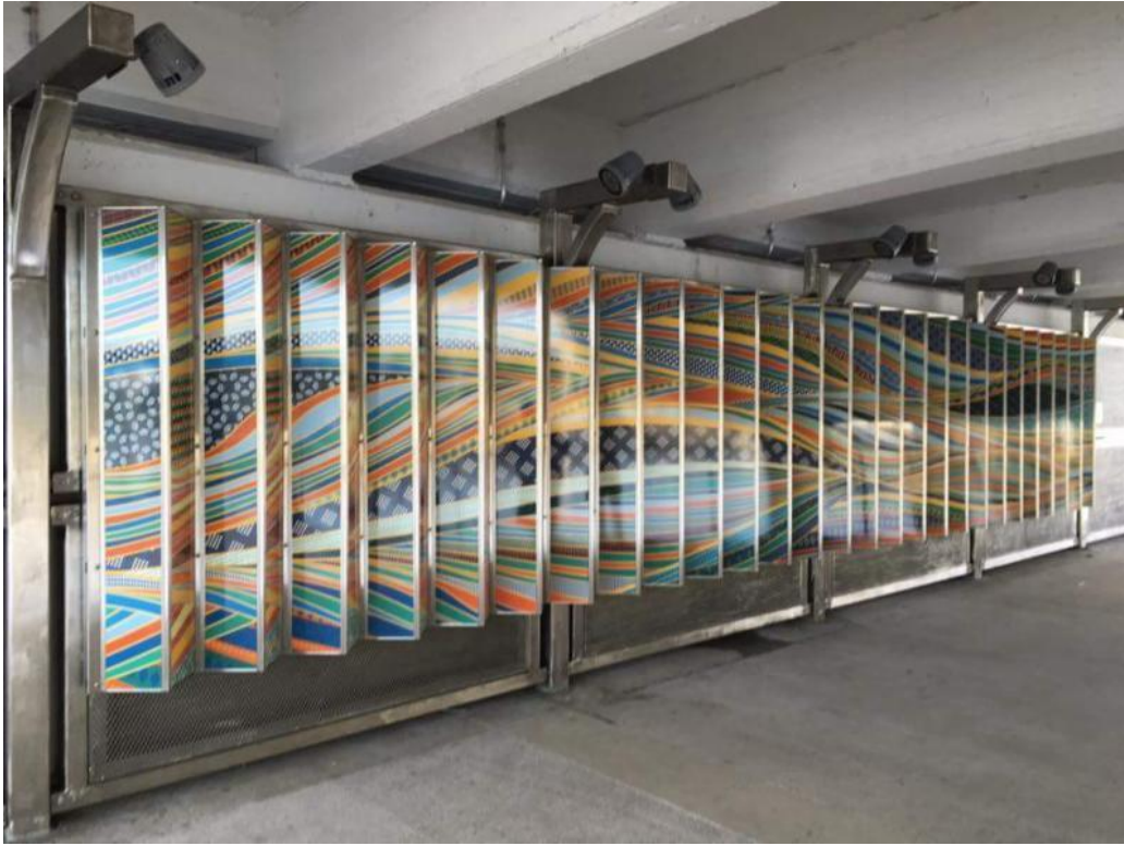
Woven Waves by Re:Site