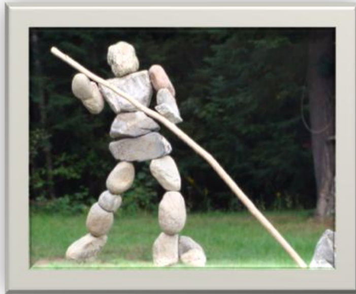
Rock-et Man by Craig Berube-Gray

Click on the link below to see the powerpoint presentation of the above sculptures: http://orangecountyfl.net/Portals/0/Library/Arts/Sample%20Finalists%20PowerPoint.ppt