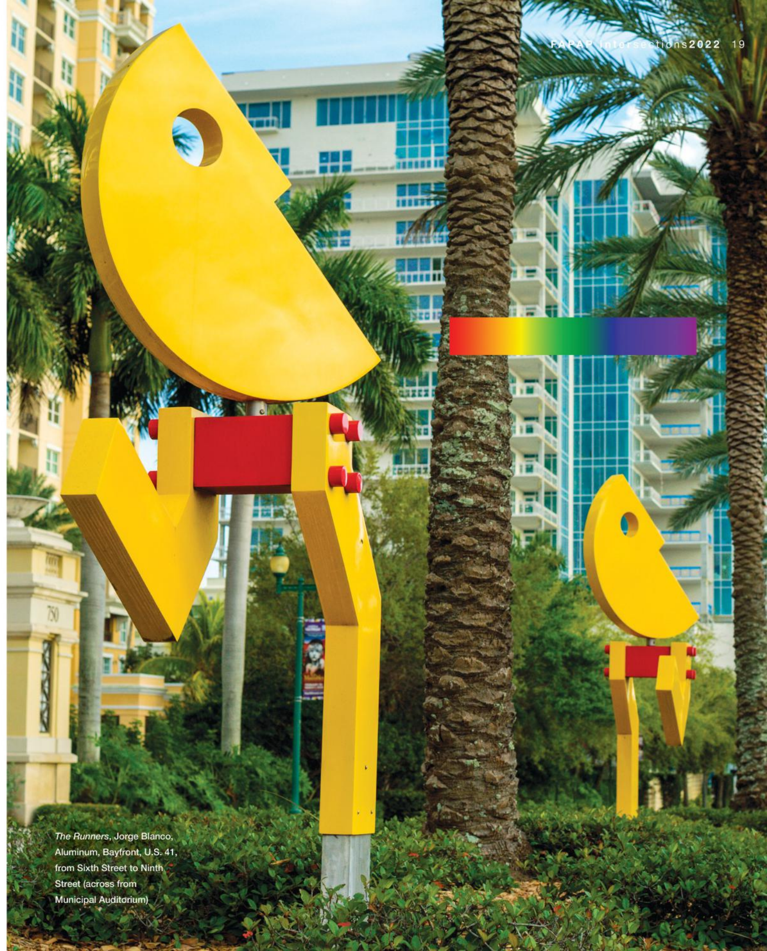
The Runners, Jorge Blanco, Aluminum, Bayfront, U.S. 41, from Sixth Street to Ninth Street (across from Municipal Auditorium)